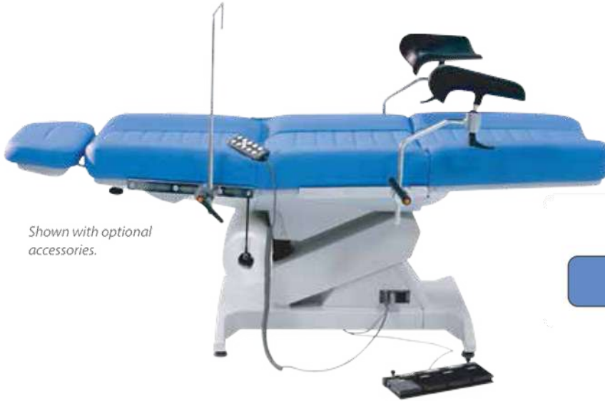
Shown with optional accessories.